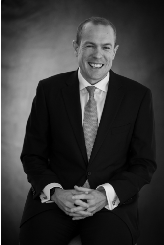
Portfolio Manager, Head of Professional Adviser Services