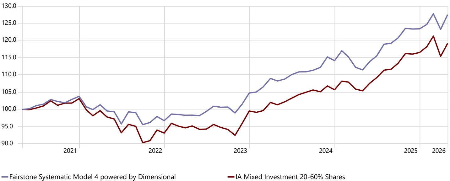
— Fairstone Systematic Model 4 powered by Dimensional